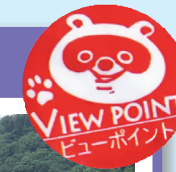
Full view of Ainokura Village Photo spot

The World Cultural Heritage & National Historic